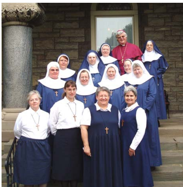
SSC at Chapter 2008 with their Bishop Visitor.

Last September the Sisters of The Servants of the Sacred Cross (SSC) met together at Mount Carmel Spiritual Centre in Niagara Falls, Ontario for their annual General Chapter. From September 7-14th, Sunday to Sunday, the Sisters held their official annual Chapter meeting, shared in worship and fellowship and celebrated various Community Rites.